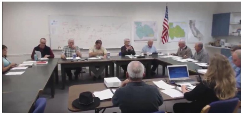
Regional Water Management Group meeting

Per the Integrated Regional Water Management Act (California Water Code Section 10539), a RWMG is composed of three or more local agencies, two of which have statutory authority over water supply or water management, as well as those other persons who may be necessary for the development and implementation of an IRWMP. The Upper Feather River RWMG consists of twelve (12) member agencies (Table 2-1), all signatories of the MOU, with seven (7) of the agencies having statutory authority over water supply or management. The composition of the RWMG provides a broad representation of water resource, natural resource and land-use management interests for the Upper Feather River region.