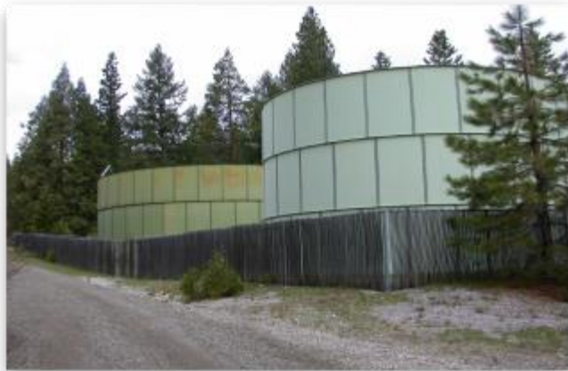
Water tanks

Drinking water regulations mandated by the California Safe Drinking Water and Toxic Enforcement Act apply to all public water systems, regardless of ownership. The U.S. Environmental Protection Agency (EPA) is responsible for ensuring implementation of the federal Safe Drinking Water Act and related regulations. The state has primacy for the public water system regulatory program in California and works closely with the EPA to implement the program. In addition, local agencies such as county environmental health departments are responsible for regulating small public water systems (typically those serving fewer than 200 homes) in most counties. The EPA directly provides regulatory oversight for tribal water systems.