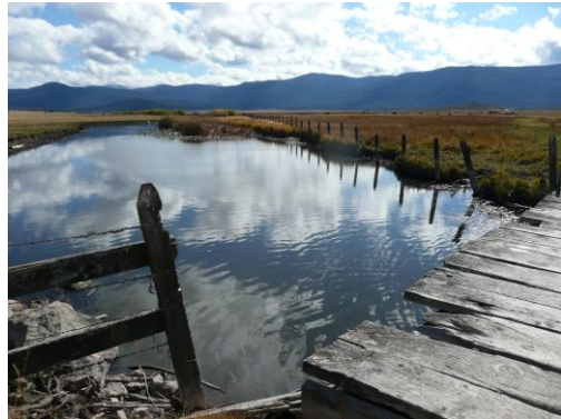
Creek fencing and livestock crossing

Agricultural land stewardship refers to private farm and ranch landowners producing public environmental benefits (conservation of natural resources and protection of the environment) in conjunction with the food and fiber they have historically provided. Land managers practice agricultural land stewardship by conserving and improving land for food, fiber, biofuel production, watershed functions, and soil, air, energy, plants, animals, and other conservation purposes. Agricultural land stewardship also protects open space and the traditional characteristics of rural communities. Agricultural land stewardship practices can protect the health of environmentally sensitive land, recharge groundwater, improve water quality, provide water for wetland protection and restoration, reduce costs of flood management, and aid riparian restoration and management projects. Land can also be managed to improve water management, stormwater runoff control, water storage, conveyance, and groundwater recharge. Such stewardship practices are particularly advantageous as they do not rely on construction of major facilities and provide a range of environmental co-benefits.