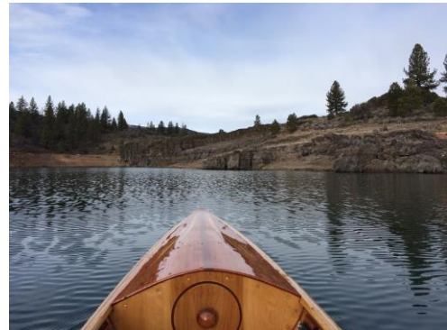
Kayaker on Frenchman Lake

Water management is a human activity, undertaken because people have an unbreakable relationship to, and dependence on, water. Essentially all water management infrastructure exists to provide water to people for out of stream uses. In-stream environmental water uses affect people through human cultural, spiritual, economic, and aesthetic relationships to water and the natural systems it supports. Encouraging conservation, efficient use, and protection of water resources among the public can have positive effects on all other aspects of water management. Recognizing the need to incorporate the relationships between people and water is important to effective and sustainable water management.