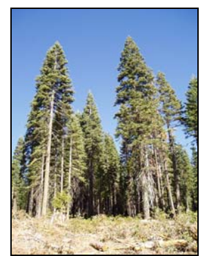
Meadow Valley Group Selection Unit on the Mt. Hough Ranger District of the Plumas National Forest.

A Group Selection is an area between ½ and 2 acres that is cleared of trees up to a maximum diameter. These areas create an opening for increasing ecological diversity and improve community stability. More than 6,830 acres of Group Selection are in place.