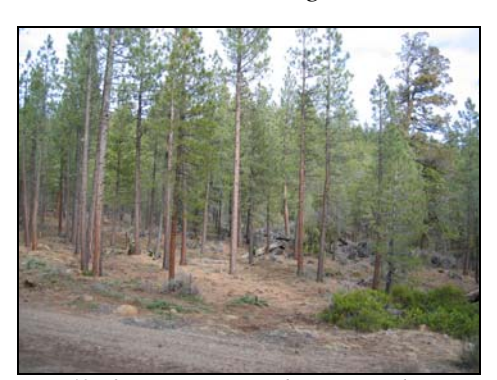
Unit 43 after treatment on the Hat Creek Ranger District of the Lassen National Forest.

Individual Tree Selection (ITS) is a method used to thin the canopy. Typically smaller diameter trees and thick areas of brush are removed to help open the forest floor. Desirable trees with potential are selected to remain and given room to grow into strong, fire-resilient trees. Across the Pilot Project more than 4,318 acres have been treated using ITS.