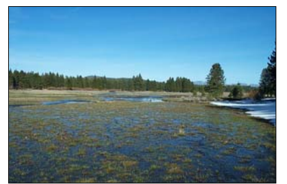
Knuthson Meadow Riparian Restoration project on the Sierraville Ranger District of the Tahoe National Forest.

Water is a critical resource in the West. As part of this, riparian restoration is restoring stream channels, improving watershed health and helping retain water for release downstream later in the summer. More than 3,999 acres of riparian restoration are completed.