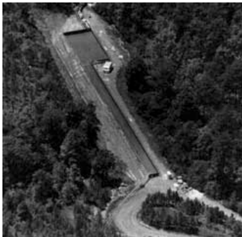
Figure I. Aerial view of the modular containment system used in the project.

The system used in this study controlled water releases from a 172,000-gal tank (Figure 1) to mimic natural peak-flow characteristics within an undisturbed study reach. This system allowed more rigorous experimental control than possible using natural events and avoided many of the operational problems inherent in storm event sampling. High frequency peak-flow events were studied because these events are more likely to be affected by natural or management related disturbances. Data were collected on a large number of hydraulic, sediment, and channel form characteristics using a variety of automated and manual sampling methods.