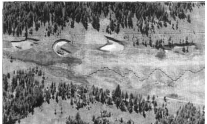
Figure 2. Big Flat Meadow after restoration. Note obliteration of gully with ponds and plugs and new sinuous (E6) channel.